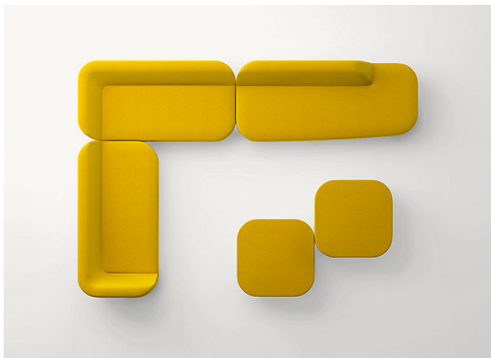
n°2 B104DS + B104FS + n°2 B104G