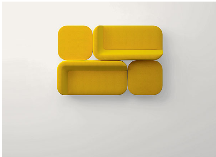
B104DS + n°2 B104G + B104DD