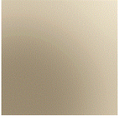
BRONZE GLASS 3051

FINISHINGS\STRUCTURE\BRONZE GLASS 3051 (1)