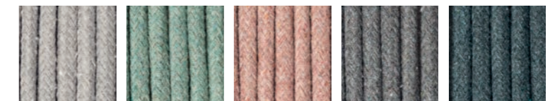
Clay Mint Rose Stone Teal