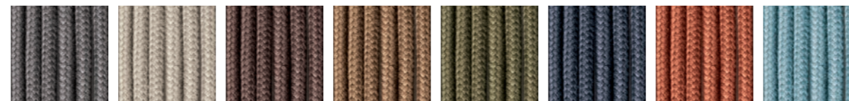
Grey Sand Brown Tobacco Olive Blue Orange Sky