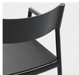
Oak Veneer Black Lacquer