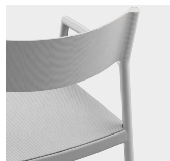
Aluminium (only available for Chair & Stackable armchair)