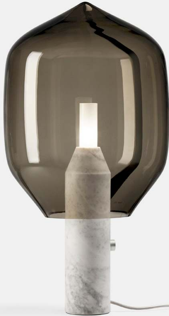
Lighthouse Ronan & Erwan Bouroullec