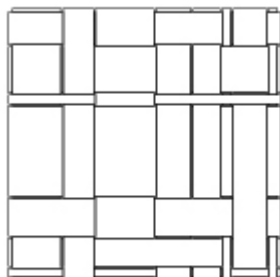
cm 300X300 118"x118"