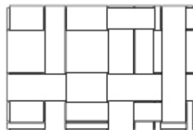
cm 200X300 79"x118"