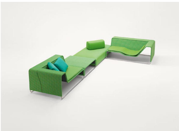
Island B11S + Island B11PA + Orlando B77B + Island B11CLD