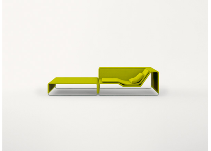
B11PB + B11CLD