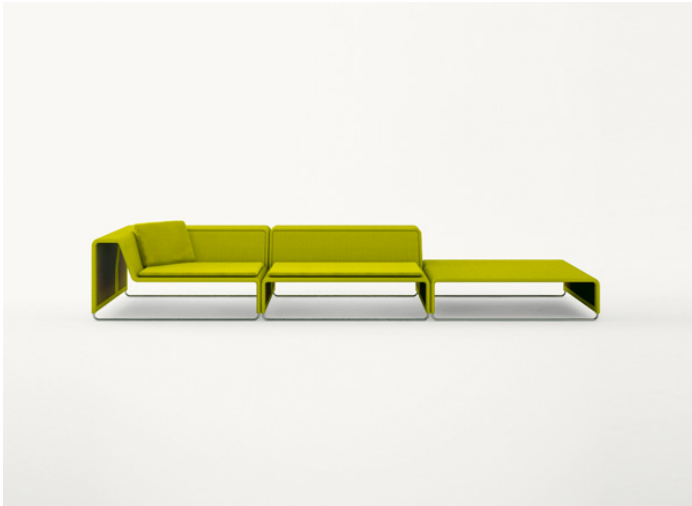
B11S + B11C + B11PB