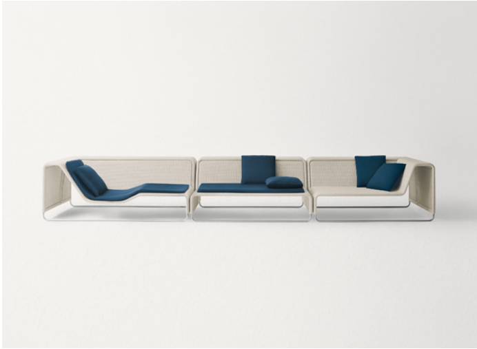
B11CLS + B11C + B11D