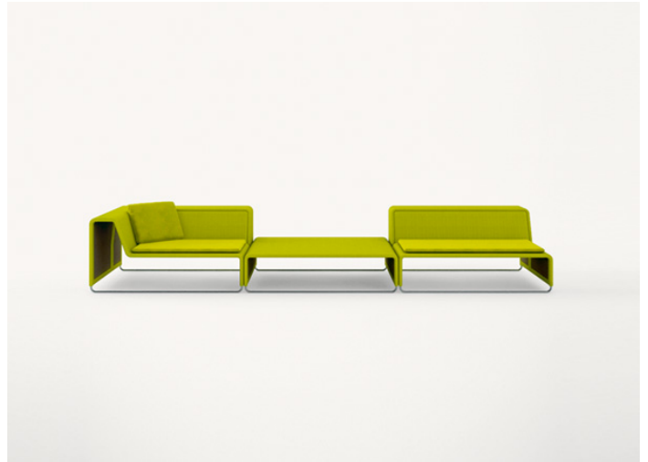
B11S + B11PB + B11C