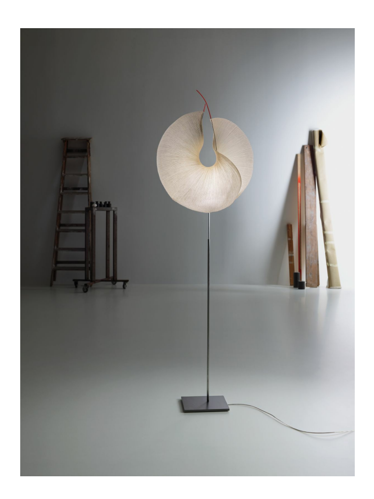
Yoruba Rose Floor INGO MAURER TEAM 2020

Paper, metal, stainless steel, silicone. Yoruba Rose Floor is a new version of the floor lamp Yoruba Rose. Just as in all other MaMo Nouchies, the lampshade consists of Japanese paper, which has to undergo a special manufacturing process in Dagmar Mombach's studio, until the desired shape is achieved. The light source is an LED module, provided with a cooling element, developed by Ingo Maurer especially for the MaMa Nouchies. Its light is so warm and soft, that any difference can hardly be noticed when compared to conventional halogen light sources.