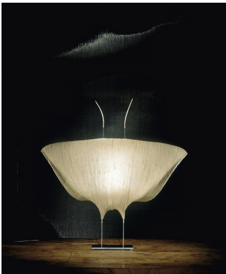
Samurai LED DAGMAR MOMBACH, INGO MAURER & TEAM 1998

Paper, metal, stainless steel, silicone, glass, glassfibre shades. Samurai LED is equipped with a dimmable LED module. The module was developed by Ingo Maurer GmbH especially for the MaMo Nouchies. The light is warm and soft, and can hardly be distinguished from conventional halogen light. In contrast to the halogen version shown in the photos, the cable is visible, as with Poul Poul.