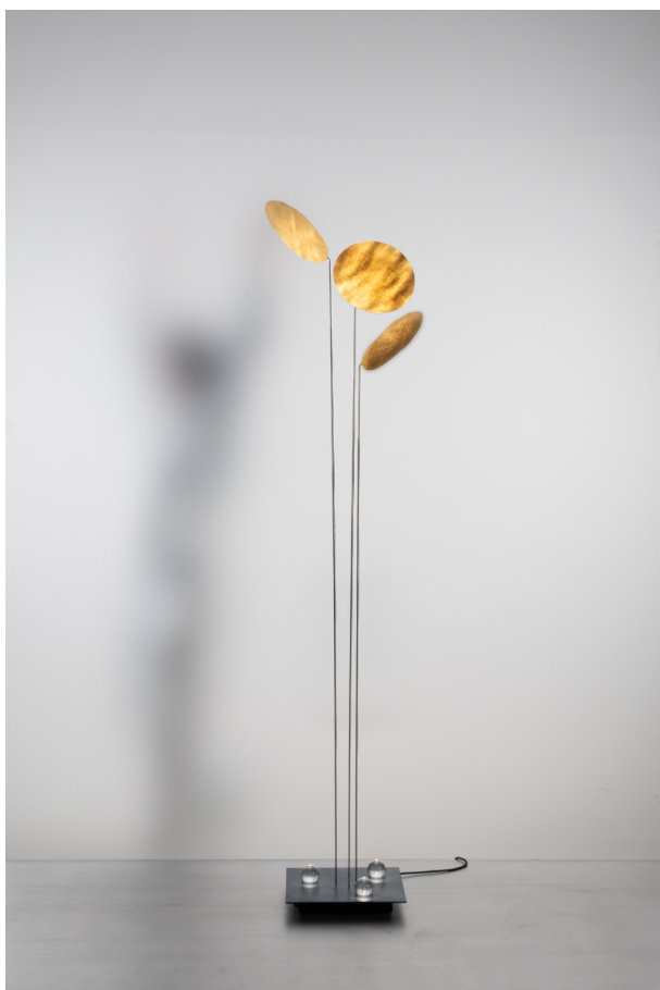
nuunu FLAVIA THUMSHIRN 2023