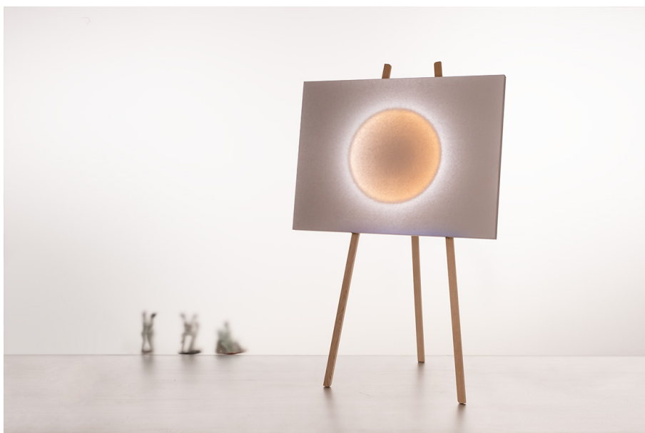
MOODMOON framed SEBASTIAN HEPTING 2023

MOODMOON framed joins the existing MOODMOON family of lamps by designer Sebastian Hepting: MOODMOON framed can be hung on the wall like a picture or used as a floor or table lamp. This is made possible by a sturdy metal frame covered with Japanese paper in which the light source is installed. MOODMOON framed offers light in different moods, ranging from LIQUID GOLD, which is reminiscent of molten, flowing gold and provides pleasant light in the living room, to INDIGO, a deep blue light that radiates calm and tranquillity. MOODMOON framed offers a total of 17 moods, eight of which are new and have been specially developed for the framed version. The closed frame allowed the designer to experiment with colourful compositions, as the colour does not radiate onto the wall but is held impressively in the frame. As with the classic MOODMOON, the various lighting moods can be selected and dimmed using the free Ingo Maurer Digital App. The luminaire contains a WLAN module. Integration into an existing Wi-Fi network is possible. The framed utilises the same proven lighting concept on which the classic MOODMOON is based: Human Centric Lighting.