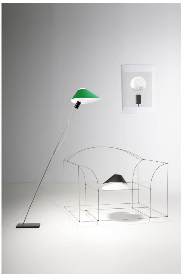
Glatzkopf Floor INGO MAURER UND TEAM 2017

Metal, cardboard, glass. Glatzkopf is based on a long-lasting lighting concept: a lampshade sits on a large glass bulb, which is fixed in the base plate via the frame and the rod. The lampshade, due to its asymmetrical form, is reminiscent of a cap and gives the fixture a certain dynamism. In the base plate are three holes, which allow the rod to be adjusted at different angles. The length of the rod can be adjusted. The paper screen makes the light bulb visible through the hole. The light bulb itself is sandblasted on the top and is equipped with LED strings.