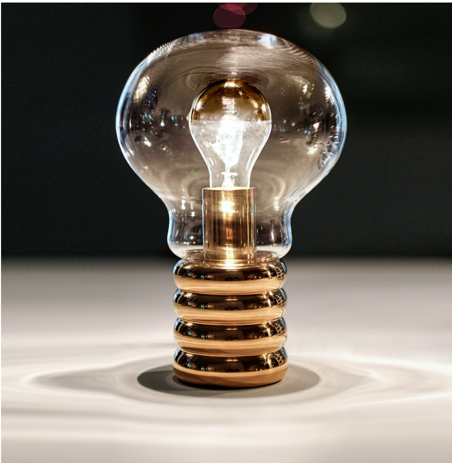
Bulb Brass INGO MAURER TEAM 2021

Brass base, mouth blown Murano crystal glass. Bulb Brass is the new member of the Ingo Maurer Bulb family. Based on the world-famous 1966 design, the Ingo Maurer team developed a brass version. The handcrafted lamp base is made of high quality brass. The untreated brass surface tends to change over time, giving it a special character. A patina is created, a surface created by natural aging. Patina is the result of daily use and is perceived as an aesthetic gain, as it stands for a characteristic material property that can ultimately be understood as the individual signature of the user.