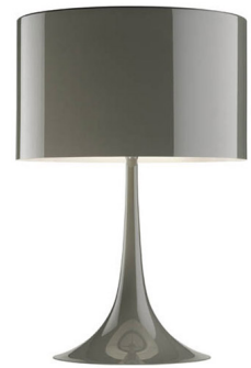
● FU661021 Mud