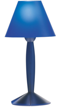
● FU625014 Blue