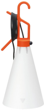
● FU378002 Orange