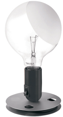
● FU330200 Black