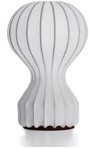
○ FU270109 White