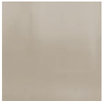
Harald 2 800