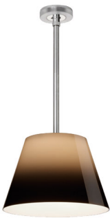
FU645220 Grey Heat Formed