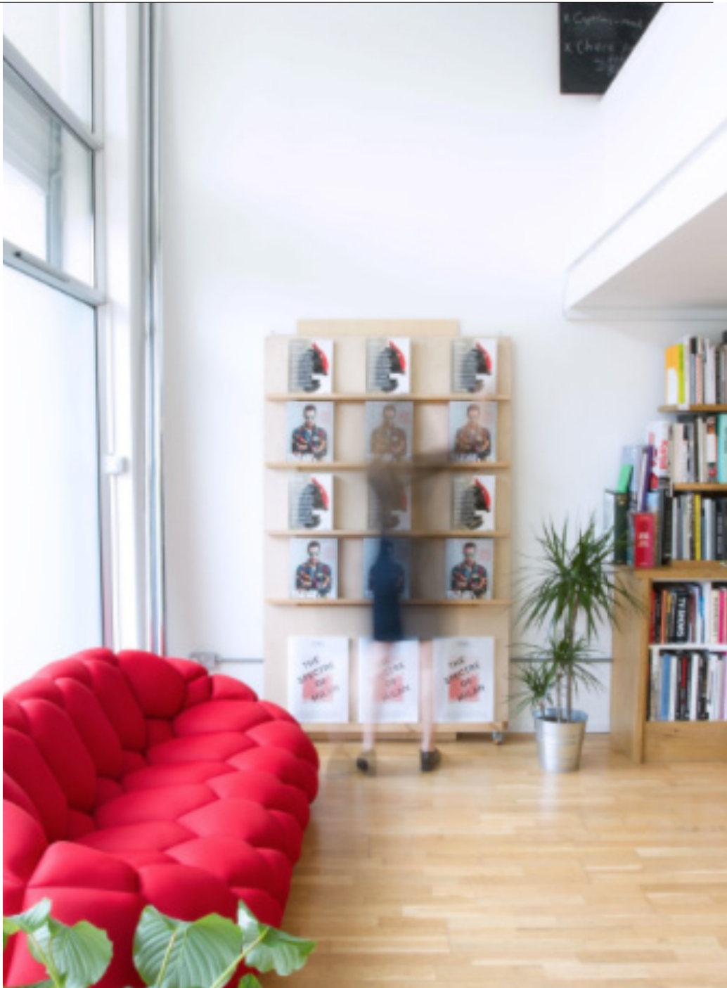
Seating Design 2009