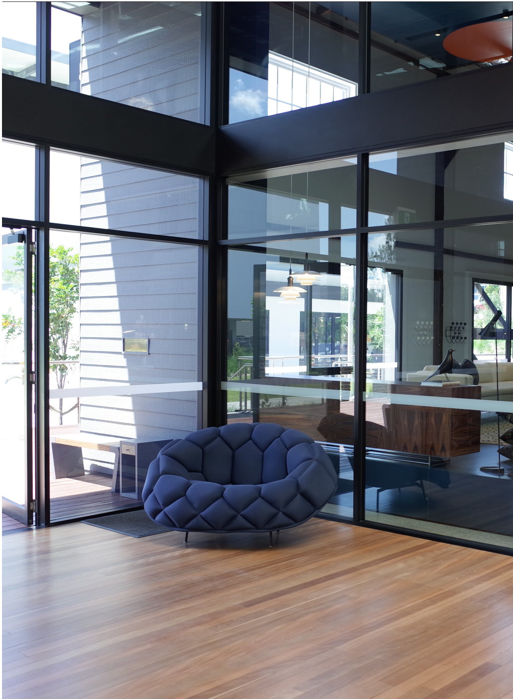
Quilt Ronan & Erwan Bouroullec