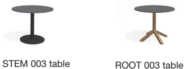
STEM 003 table