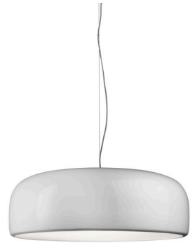
○ FU136009 White