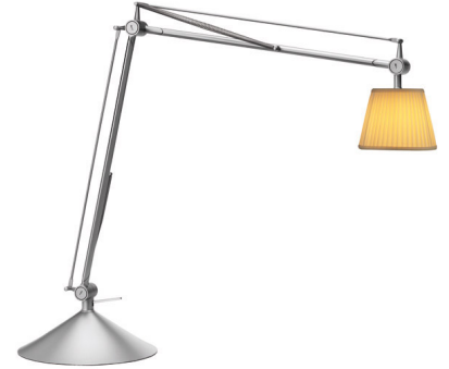
FU037300AB Plisse Cloth