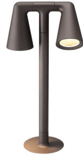
● FU090626 Brown