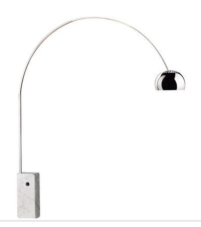
FU030000 Stainless steel