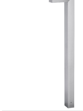
F0072054 Anodized Aluminum

NOTE: This item requires separate purchase of a lens accessory. Lenses are available in Frosted (F0074071) or Clear (F0074000). Louver (F0056030) Lens accessory is also available. Please contact <u>Customer Service</u> for details.