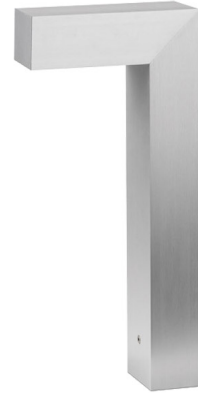
F0071054 Anodized Aluminum

NOTE: This item requires separate purchase of a lens accessory. Lenses are available in Frosted (F0074071) or Clear (F0074000). Louver (F0056030) Lens accessory is also available. Please contact Customer Service for details.