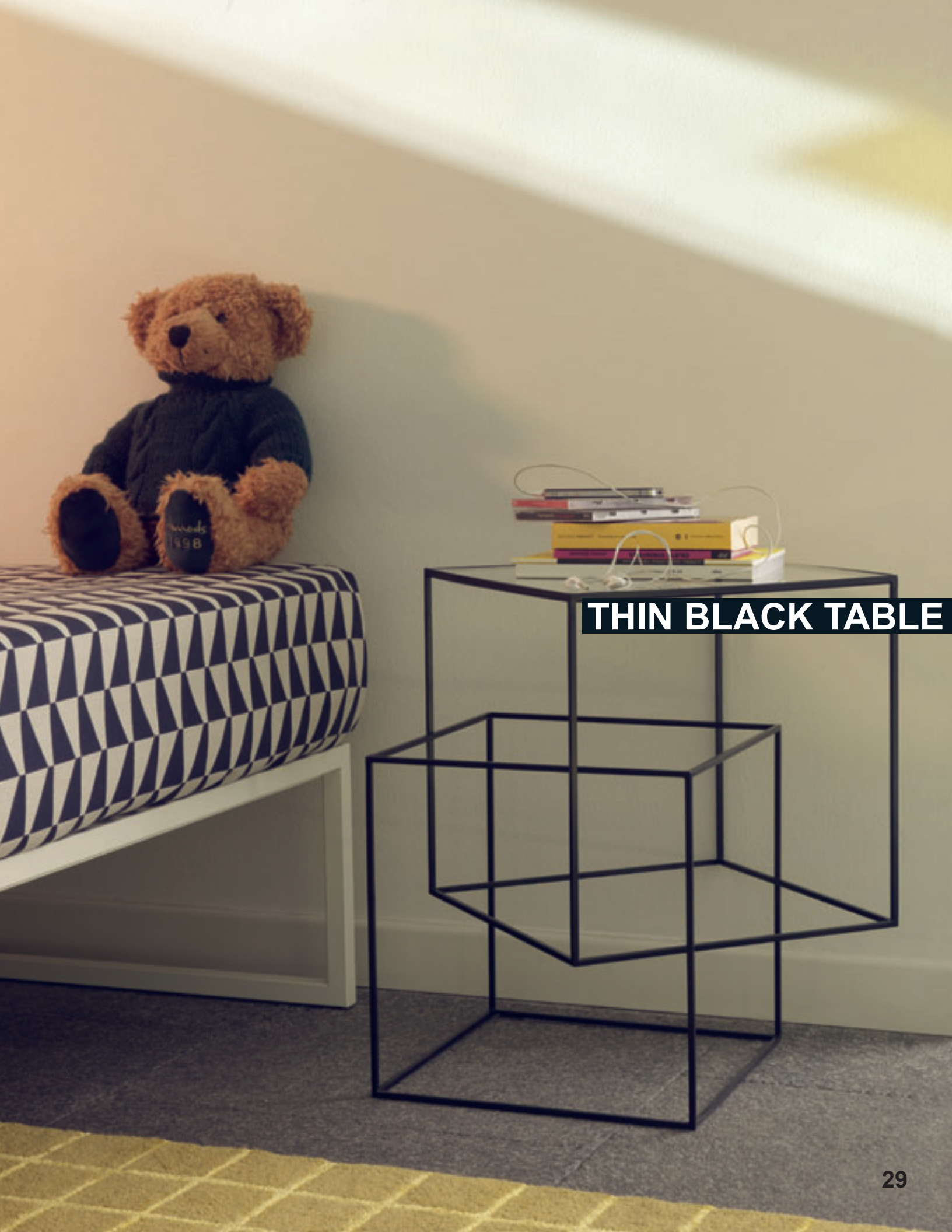
THIN BLACK TABLE