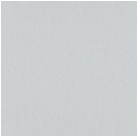
Leather 900 G