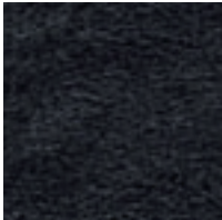
Leather Extra 983 G2